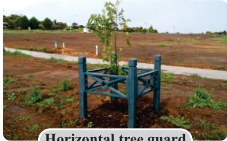
Horizontal tree guard

This sturdy recycled-plastic barrier is designed to safeguard your trees. By connecting these panels to our 100 mm square bollards we can create a stylish and economical solution for the protection of your trees.