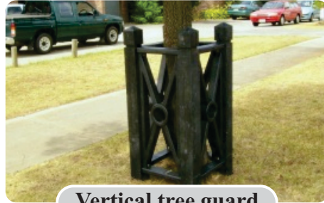
Vertical tree guard