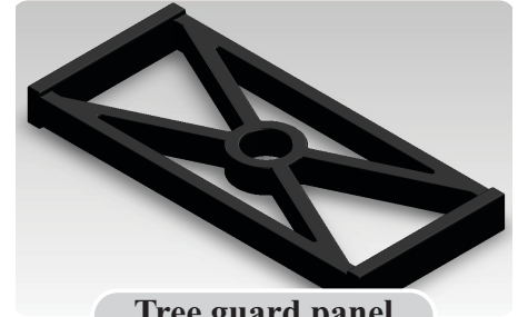
Tree guard panel

The kit includes four 100 mm square bollards, four tree guard panels and sixteen 75 mm bugle fasteners. Bollards and tree guard panels are also available individually.