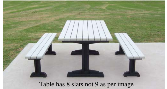
Table has 8 slats not 9 as per image