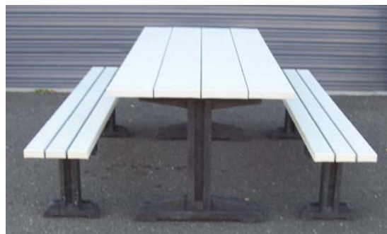
In Ground image not available