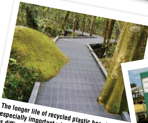
The longer life of recycled plastic boardwalks is especially important where maintenance access is difficult. Greater flexibility compared with wooden slats also means less disruption from tree roots or other ground movement.