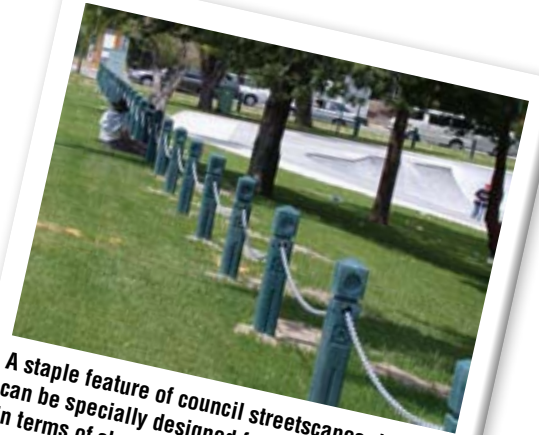
A staple feature of council streetscapes, bollards can be specially designed for individual councils in terms of shape and colour.