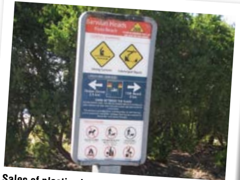
Sales of plastic signage products have grown almost 300 per cent in recent years, with the litigation risks associated with hard to read or broken warning signs behind the push to longer lasting plastic products.