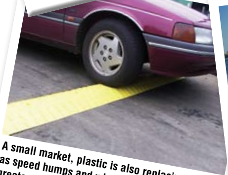
A small market, plastic is also replacing concrete as speed humps and wheel stops, due to the greater ease of installation.