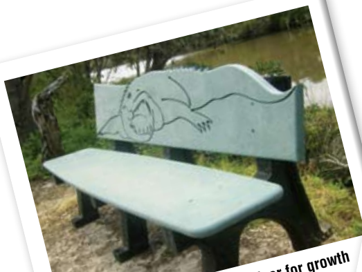
Reduced maintenance is the driver for growth in plastic furniture – especially for councils constantly sanding graffiti off wooden slats. The molded products can also be shaped to suit specific areas.