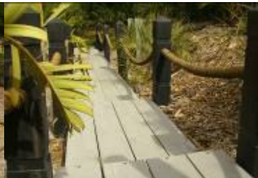
150mm bollards & planking