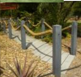
125mm bollards & planking