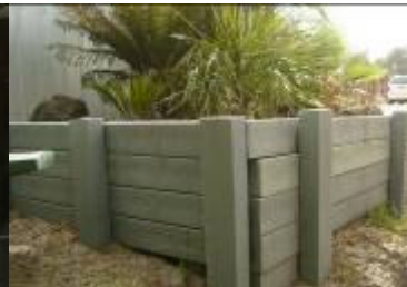
Profiles for retaining walls